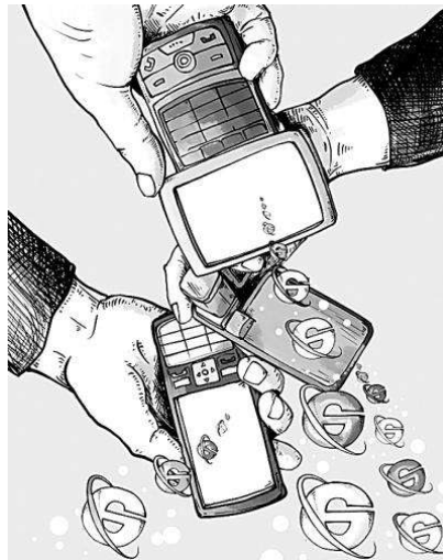
Figure 1 Micro

spread of social networks of a female student to make improper remarks to the country, this incident, not only Chinese uproar, but also let educators sad, how can a college student enjoying national resources, receiving public fees to study abroad, to cultivate their motherland, and constantly hurt the feelings of compatriots? From the macro point of view, it also reflects the flaws in the ideological and political education of contemporary college students. If our education is only to make wedding clothes for others and only to build the foundation stone for the development of capitalism, then the education of Chinese colleges and universities is a complete failure, and our country is not only difficult to develop and move forward, but may even have a crisis of retrogression. Therefore, the ideological and political education for college students is not only to cultivate all-round development of scientific and technological talents, but also to promote the harmonious development of society[2].